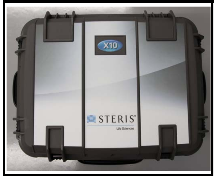
(Typical only - some details may vary.)

The X10 Biodecontamination Unit features X-Phase hardware technology and VaproxLink software technology. X-Phase hardware technology enables Pre-Heat, Dehumidification, Condition, Biodecontamination and Aeration of the safety cabinet for an All-In-One unit design while VaproxLink software technology automatically identifies Vaprox 59 Hydrogen Peroxide Sterilant cup and verifies expiration date.